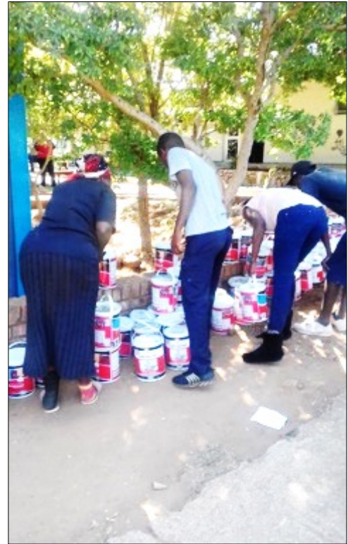
ED Beneficiaries collecting roof & floor paint