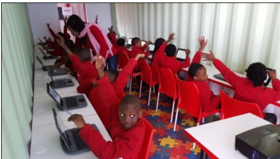
IT Tuition in the Vodacom donated computer lab

With a generous donation of 20 tablets, projector, 2 laptops, a printer and 1Gig Data per month, Vodacom SA made it possible for Viva Independent School to have its own E-Learning classroom. Vodacom likewise furnished and transformed one of the shipping container classes into a secure computer lab.