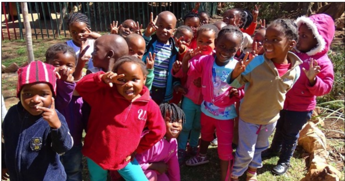
Viva Kids Early Learning Centre, Mamelodi East

The Viva Township Art Festival took place on Youth Day [16 June 2018] at the Viva Village, Alaska Informal Settlement. A very successful talent competition and show were presented, called “Viva’s got Talent”. Artists, Dancers, Poets, Musicians, Actors and Vocalists had an opportunity to present their talents for Prize Money.