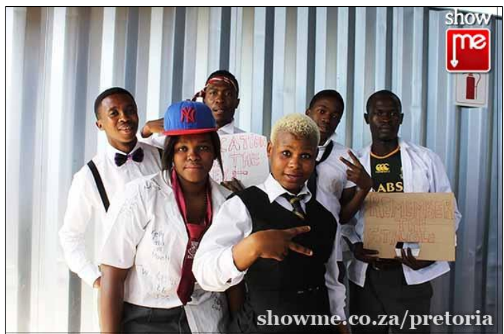
Switch On Youth at Viva's got Talent, featured on Showme Pretoria

The Youth Development programme focused on integrating the arts into the After School programme and presented several successful events and initiatives. The Youth Day celebrations on 16 June 2018 was the highlight on the Switch On Youth calendar. Dozens of groups prepared and participated in Viva's Got Talent in 4 categories: Music, Drama, Dance & Poetry. Several shack-homes in the community were transformed into works of art as well.