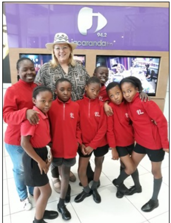
At Jacaranda FM Good Morning Angels