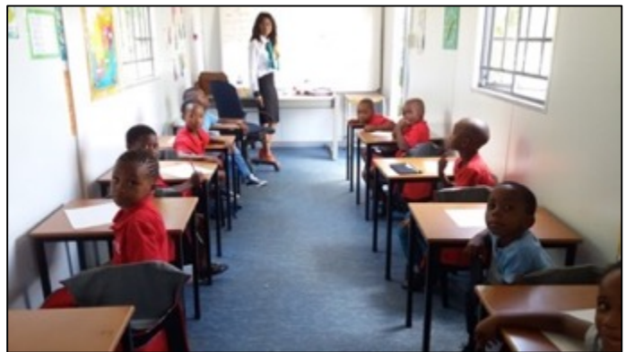
Inside a converted shipping container classroom

20 learners fill the desks of the Grade 1 classroom with a teacher and Assistant teacher. In the first term attention is given to knowledge gaps and to give opportunity to the learners to master the change in the academic level between Grade R and Grade 1. The Grade 1 Home Class is also the Numeracy Station.